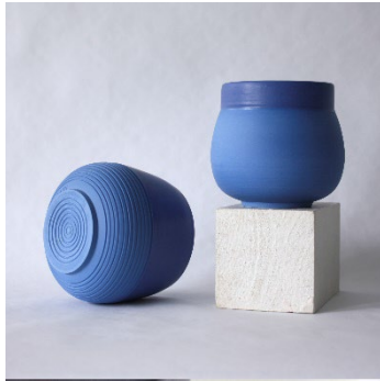
UPSALA Charlotte Smith

SIO-2® Upsala clay works well with most liquid glazes, however it has such a naturally stunning blue color that a transparent glaze is recommended to let your piece show its true colors.