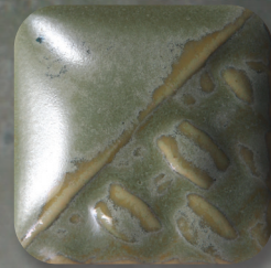
SW-108 Green Tea