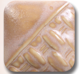
SW-168 Coral Sands