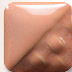
SW-168 Coral Sands