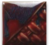
SW-402 Dark Flux under SW-510 Blue Gloss