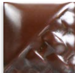
SW-128 Corodovan under SW-510 Blue Gloss