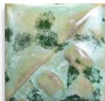
SW-148 Lime Shower under SW-510 Blue Gloss