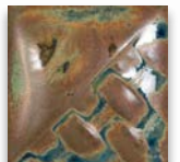
SW-179 Muddy Waters under SW-510 Blue Gloss