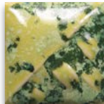
SW-148 Lime Shower under SW-510 Blue Gloss