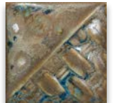
SW-179 Muddy Waters under SW-510 Blue Gloss