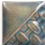
SW-146 Aurora Green under SW-510 Blue Gloss