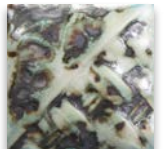
SW-147 Moonscape under SW-510 Blue Gloss