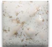
SW-118 Sea Salt under SW-510 Blue Gloss