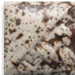
SW-155 Winter Wood under SW-510 Blue Gloss