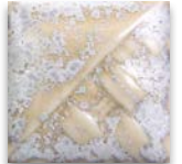
SW-118 Sea Salt under SW-510 Blue Gloss