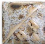
SW-155 Winter Wood under SW-510 Blue Gloss