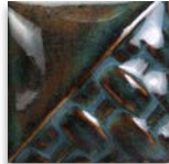
SW-101 Stoned Denim under SW-510 Blue Gloss