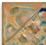
SW-180 Desert Dusk under SW-510 Blue Gloss