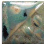
SW-146 Aurora Green under SW-510 Blue Gloss