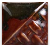
SW-402 Dark Flux under SW-510 Blue Gloss