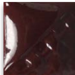
SW-128 Corodovan under SW-510 Blue Gloss