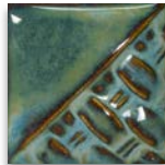
SW-101 Stoned Denim under SW-510 Blue Gloss