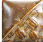
SW-117 Honeycomb under SW-510 Blue Gloss